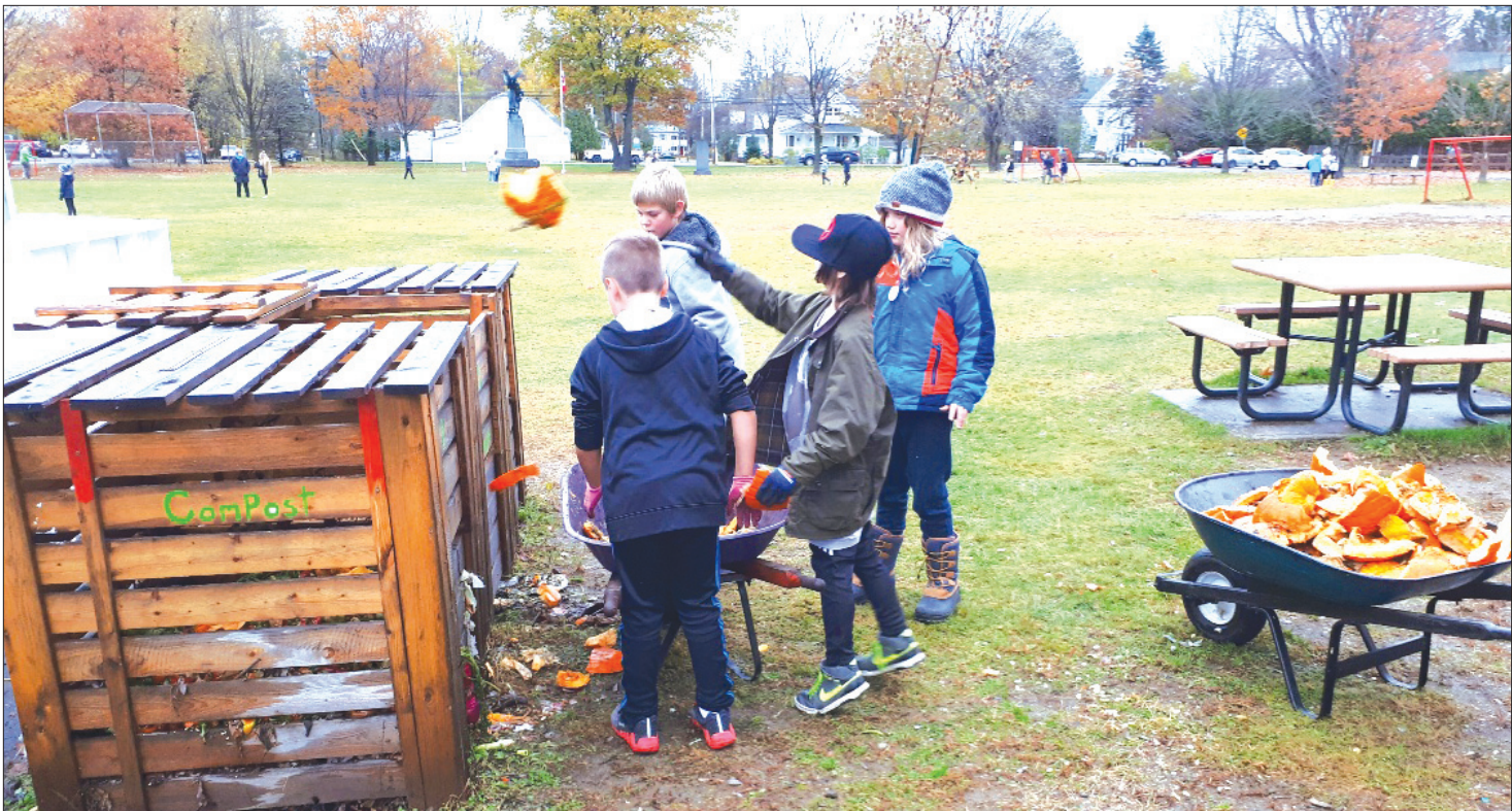
Students used hammers and their feet to smash pumpkins to put them into the compost bins

A total of 2,900 pounds of fresh fruits and vegetables were given to the school